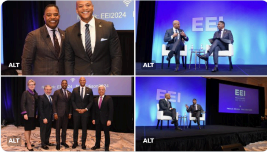
Governor Wes Moore

I relish speaking with a great leader and friend, @GovWesMoore, about driving policies that support clean energy goals and leading an equitable energy transformation in our great state of Maryland. Thank you, @Edison_Electric for providing this critical space.