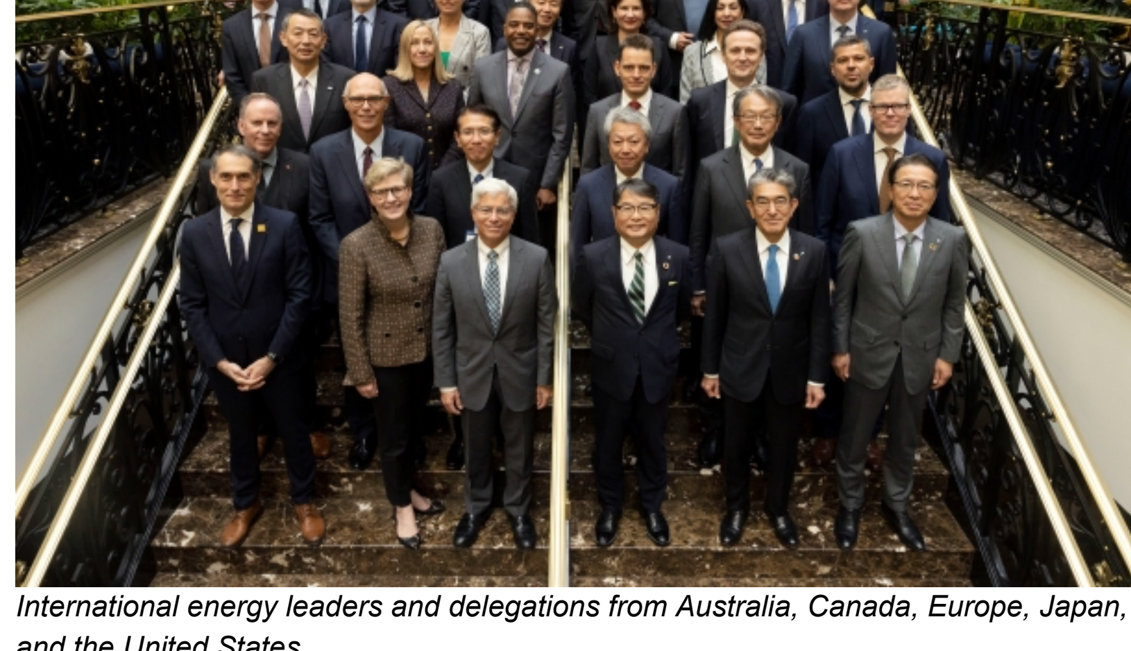
International energy leaders and delegations from Australia, Canada, Europe, Japan, and the United States.

In the face of growing wildfire risk, learn how some electric companies are taking steps to predict, mitigate, and prevent wildfire risk and liability. Download this executive report to gain a better understanding of liability exposure and mitigation best practices to reduce wildfire impact.